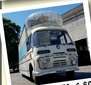
Sounds of the 50s & 60s

Get nostalgic with a lively weekend of music from these popular decades. There is a chance to watch a short film from the only mobile cinema in operation from the 1960s.