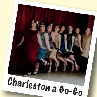
Charleston a Go-Go

Fun and flappers! Step back in time to the 1920s. Enjoy live music and join in with dancing from Charleston a Go-Go.