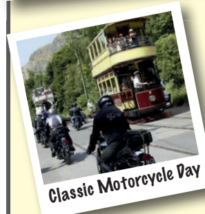
Classic Motorcycle Day

Enjoy browsing the exhibition of classic motorcycles manufactured before July 1997.