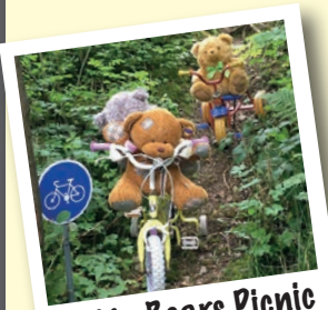
Teddy Bears Picnic

from 12.30pm – 2.30pm each day. Walk the Teddy Trail in the Woodland Walk.